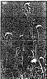
Thistles bloom along the River Trail in Heritage Park.

Although it contains no playground equipment, West Bloom-