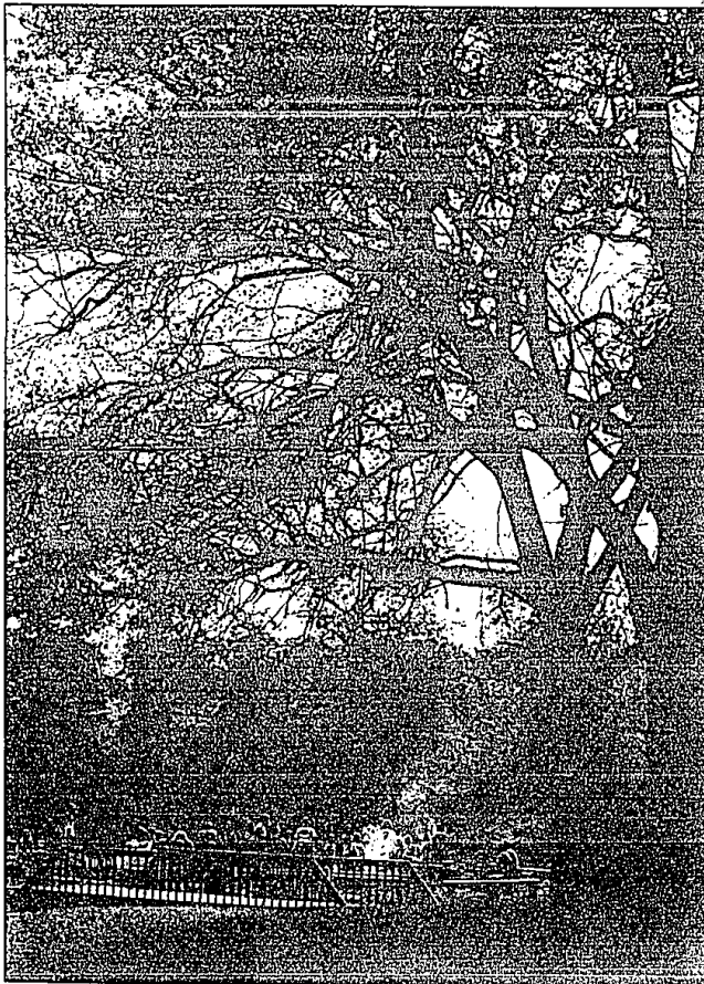
Heritage Park, the newest of Farmington Hills' parks, has been a popular place for picnics since its opening.

swimming at the Bailey Recreation Center's outdoor pool can provide a cool-off to end the excursion. For information, call 722-7520.