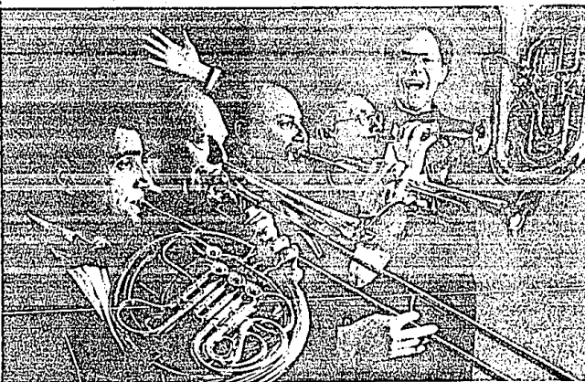
Canadian Brass appears at 8 p.m. Saturday, Aug. 5, at the Meadow Brook Music Festival.