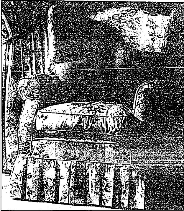
Stripes and florals are combined in a variety of new decorative themes, among them "Floral Stripe" chintz, shown here, by Laura Ashley. This large-scale design of roses, morning glories and fuchsias with alternating geranium stripe, is available in chintz and printed ottoman fabrics. The simplicity is also repeated in a companion wallcovering, seen beyond the chair. Similar choices appear in English-manor type homes featured in this year's Homearama.