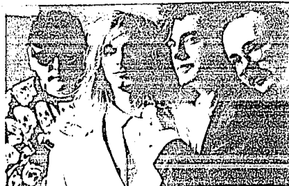
Cheap Trick performs at 8:30 p.m. Friday, Sept. 1, at the Michigan State Fair in Detroit.

The young people of Michigan are displaying their crafts and talents for prize money and ribbons through Monday, Sept. 4, in the Youth Division Exhibits of the 1989 Michigan State Fair in Detroit. The fair offers a wide variety of youth exhibits entered by young people 9-19 years old. Exhibits include Livestock Judging Contests, Showmanship Contests, Rabbits, Educational Exhibits, Homemaking, Industrial Arts, Art Exhibits, Public Speaking Contest, Garden Exhibits, Crops, Fashion Show, Hobby-Crafts, Horticulture and Dog Shows. The 14th annual fair, one of the oldest state fairs in the nation, runs through Labor Day, from 10 a.m. to 10 p.m. daily. For additional information on any event at the fair, call 368-1000.