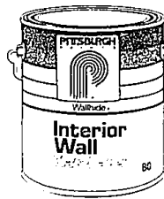
Wallhide® Flat Latex

Get $2 back for every gallon of interior paint you buy!