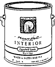
Manor Hall® Interior