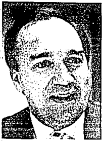
John Engler GOP candidate