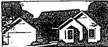
2,126 sq. ft. ranch Detached & Walkout available Other models up to 2,660 sq. ft.