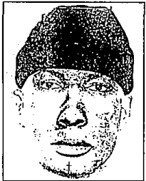
This is a composite drawing of the man believed to have tricked the Bavarian Village Ski Shop in the Orchard-12 Shopping Center out of $62 March 20.