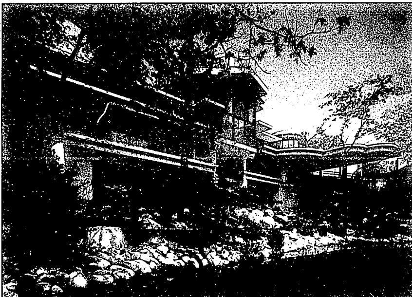
Extensive use of glass and white brick that blends into the surrounding habitat are used to make this Oakland County