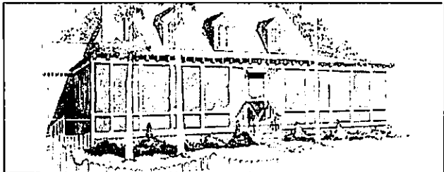
Here's an outdoor living room with the moths and mosquitos — a place where you can enjoy outdoor living in airy comfort.