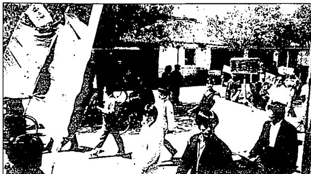
Students conducted demonstrations throughout small towns in China including these students in Chengde.