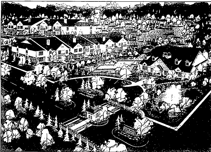
Holtzman & Silverman's 20th apartment development is Village Green of Canton with 272 units on 31 acres. Construction started in late 1989. Occupancy begins in June. Rents range from the high $400s to low $700s.