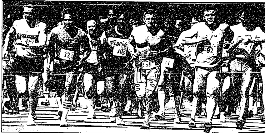
Law enforcement officers begin the 10K run to raise money for the Muscular Dystrophy Association.

The run will continue to be a prelude to the annual Farmington Hills Police Department open house the first Sunday in June.