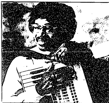
Buckwheat Zydeco, led by Stanley "Buckwheat" Dural, Jr., and the Il Sont Paris Band, opens the P-Jazz Summer Outdoor Concert Series at 6:30 p.m. Wednesday, June 20.

The Stars and Stripes, laser lights and music, will burst from Freedom Hill in Sterling Heights when country music station WWWW-FM (106.7) celebrates its first "W4th of July" on July 4. Emmylou Harris will appear in concert, along with special guests the O'Kanes, followed by a "laserworks" light show. Local bands will kick off the festivities and a barrage of patriotic songs will cap off the celebration. Gates open at 4 p.m. Festival seating will be on a first-come, first-served basis. Families are encouraged to come early and