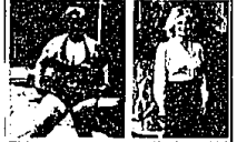
This woman reportedly lost 104 pounds while on the formula.

UNEXPLAINED WEIGHT LOSS PUZZLES SCIENTISTS FINLAND — The unexpected weight loss experienced by members of a test group has puzzled medical researchers at a leading Finnish university. Scientists were testing a naturally-occurring compound for its ability to lower blood cholesterol levels when, to their surprise, they found that every person who took the formula had lost a significant amount of weight. The formula was then tested at another prestigious European university hospital. Again, all patients lost weight even though they did not change their eating habits. The report detailing this study, published in the British Journal of Nutrition, stated: "Body weight was significantly reduced even though the patients were specifically asked not to alter their dietary habits."