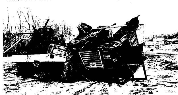
DEMOLISHED —The cab was completely demolished but the driver escaped serious injury when his truck hit the center abutment for the pedestrian bridge over I-696. The bridge was used by Harrison High students but was not being used at the time of the accident, at 1:45 a.m. Feb. 9. (Evert photo)

dian was hit by a truck. A portion of the bridge can be seen lying on the ground behind the trailer. (Evert photo)