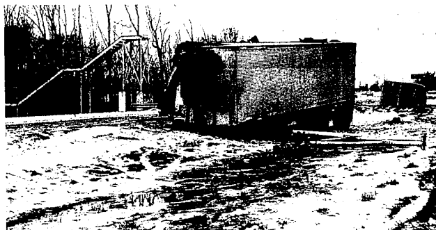
BRIDGE OUT —The pedestrian bridge over I-696 east of Orchard Lake Rd. was knocked out Tuesday when the center abutment in the median was hit by a truck. A portion of the bridge can be seen lying on the ground behind the trailer.