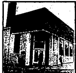
WAYSIDE GIFTS 820 W. ANN ARBOR TRAIL 453-8310