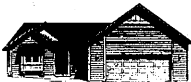
1-Year Adjustable Rate Mortgage: $225,000.

Whether you need a mortgage in the neighborhood of $50,000 or $200,000, chances are you can find it at one place. Comerica.