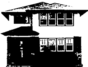
30-Year Fixed Rate Mortgage: $115,000.