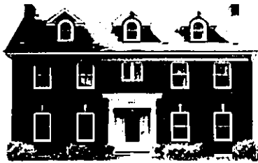
15-Year Fixed Rate Mortgage: $350,000.