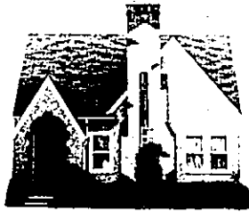
15-Year Fixed Rate Conventional Mortgage: $95,000.