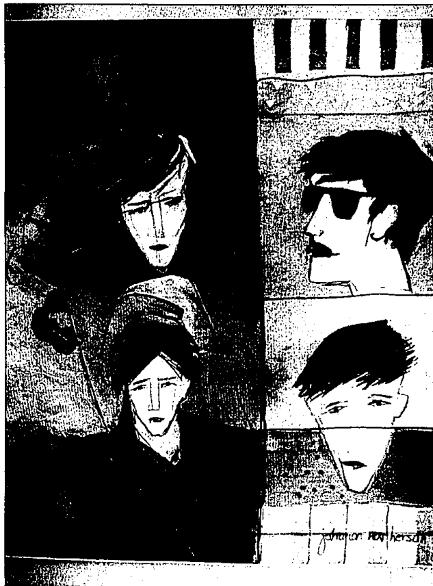
This vibrant display of color by Johanon von Horson is a futuristic art form referred to as Soft Art. Acrylic/felt fabrics, in endless color combinations, are blended into a layered collage placed in a 14,000-needle press to create a flat and flexible surface.

The Linda Hayman Gallery is at 32500 Northwestern Highway, Farmington Hills.