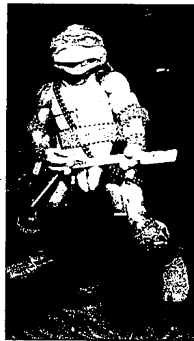
Michaelangelo, who plays a three-string guitar, got the crime fighters into music with a "Pizza Power" rap song composed while waiting for a subterranean pizza delivery.

When not jamming, April is doing news reports on the boys' travels.