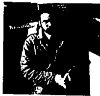
FBI officials suspect this man of robbing at least eight banks in Oakland and Wayne counties over the last year.

In all four robberies a note was passed to tellers asking for money, and the thief did not openly display a weapon. Another similarity is the time of day the robberies have occurred, with all four happening between 10 a.m. and 11 a.m. In all but one robbery the thief carried a briefcase.