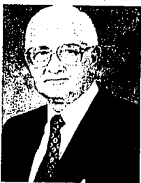
Marvin L. Esch, Republican