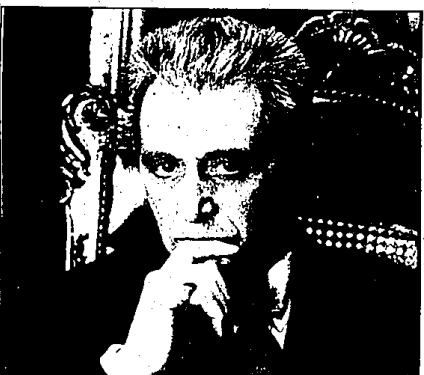
Al Pacino re-creates his role of Michael Corleone in Francis Ford Coppola's "Godfather III," the continuing epic of the Corleone family.