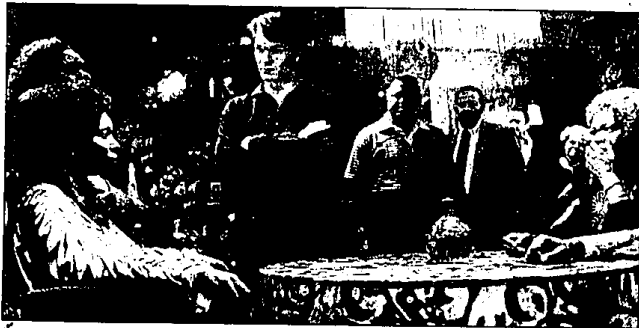
No question about it. "Ghost," with Patrick Swayze as the ghost and Whoopi Goldberg as the psychic who can hear him, has a lock on top spot for box office takes in 1990.