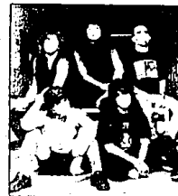
Anthrax will appear with Iron Maiden at The Palace of Auburn Hills at 7:30 p.m. Monday, Feb. 4.

● RED C Red C will perform Friday, Feb. 8, at