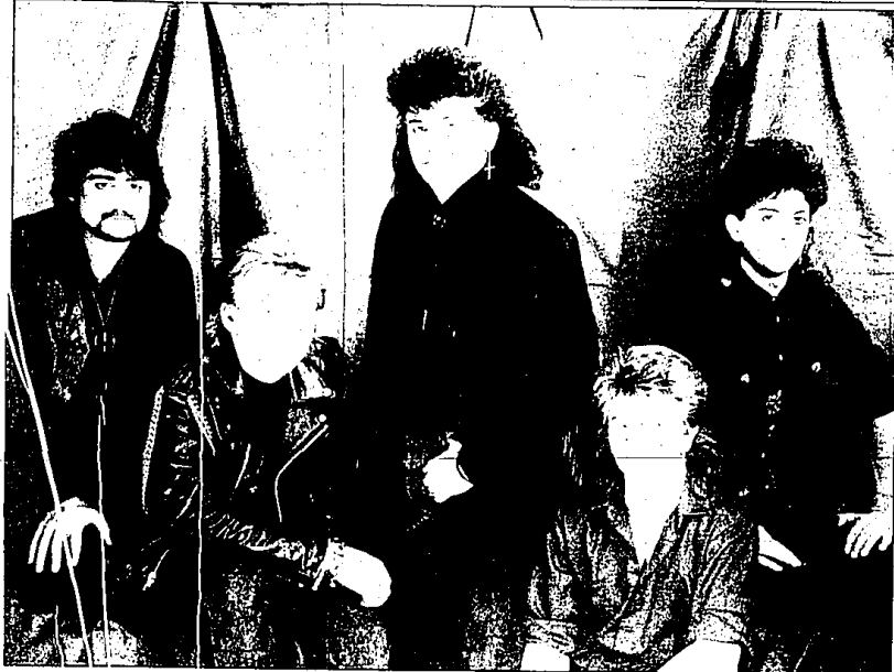
League of Nations may have gotten caught in rockers with a message movement of the 1980s, but in the '90s the group has decided that rock'n'roll is suppose to be fun.