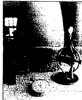
1920s Ropewick candle on silver plate (right); Revclstad Bros. 17-jewel pocket watch (center); late-1800s tin-type photo (left) in a gutta-percha frame.