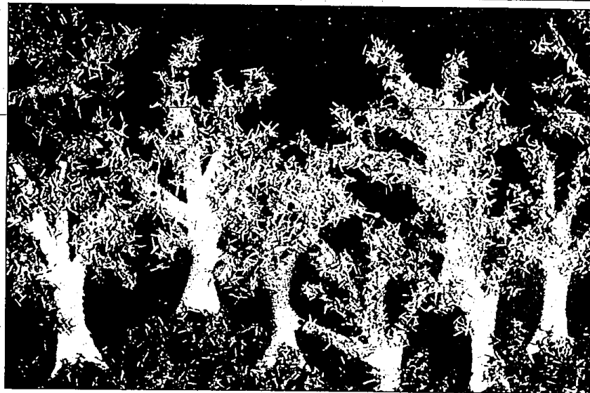
This Yvette Goldberg collage is entitled "In the Still of the Night." To create the black background, she used India ink around stencils of trees. "For foliage, I used the finely

GOLDBERG CREATED the collage "Putting on the Ritz" using gift wrapping paper, photographs from catalogs and magazines, and