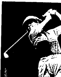
Betsy King will defend her title during the Nabisco Dinah Shore Invitational, Saturday on ABC.