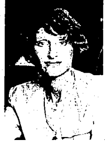
Sen. Lana Pollack D-Ann Arbor

House Democrats prefer a plan to cut property taxes on smaller households and raise business taxes to pay for the cuts.