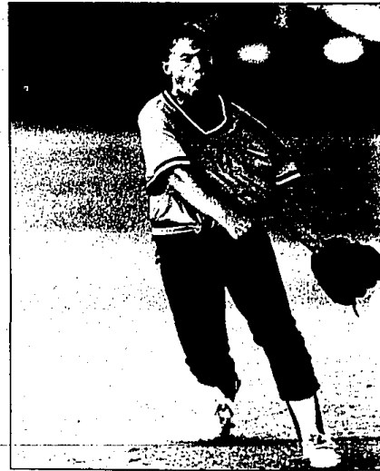
record in district tournament play this weekend.