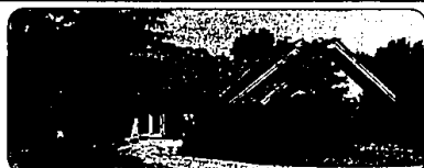
ROCHESTER. Quality, sophistication, ease and beauty abound in the professionally designed interior of this Contemporary. Features an abundance of glass to view the 2.1 acres overlooking Paint Creek. Beautiful gourmet kitchen featuring a garden room with fireplace. Finished walk-out. Four bedrooms and 3 1/2 baths. $569,900 651-8850 04-A-5973