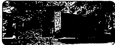
BLOOMFIELD HILLS. Upper Long Lake Quad-level offers over 122 feet of prime waterfront property. The open, spacious floor plan offers unlimited potential. Highlights of this 4 bedroom home include a white Euro kitchen with all appliances and beautiful views. Fireplaces in living room and master bedroom. $649,500 851-8100 06-B-6169