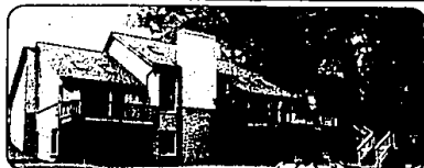
WHITE LAKE. Builder's home on Oxbow Lake with spectacular views. The expansive interior includes 3-5 bedrooms, a large solarium, great room, 3 1/2 baths and a walk-out lower level. Family room and living room both showcase cozy fireplaces. Professionally landscaped grounds. Many custom features and extras throughout. $395,500 851-8100 06-B-6173