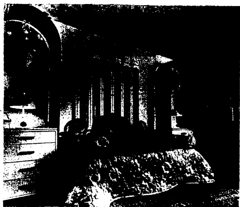
DREAM ROOM — For a little girl growing up, Miami designer Bob Rubenstein, A.I.D., designed a bedroom neither too young nor too old. A pink and green ceiling flowers overhead like a canopy. Bedspread matches the wallcovering on the ceiling. Green wicker headboard, rocker and arches over white chests keep the light, airy touch.