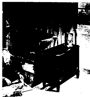
A NEW furniture-styled electronic air cleaner by West Bend provides a cleaner, more comfortable home environment by removing a wide variety of pollutants from the air you breathe. Air Care unit effectively removes up to 90 per cent of all airborne dust, smog and smoke from the air which passes through the unit.

Make a plan for any planting or landscaping to be done and set up a schedule of work to be accomplished as the season progresses: Lawn seeding and feeding in late March and early April; Planting of deciduous (leaf-losing) trees and shrubs and roses in April; Planting seeds of hardy vegetables and flowers in warm, dry and workable soil in April and early May; Transplanting perennials and evergreen trees and shrubs in May, and finally at the end of May planting seeds and bulbs and setting out plants of tender vegetables such as tomatoes and beans and flowers such as zinnias, petunias, marigolds and geraniums.