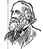
JAMES J. HILL

"It is not nearly so important for one to get there first as it is to be able to stay there after having arrived."