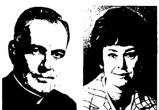
THE REV. THEODORE HESHBURGH, CSC