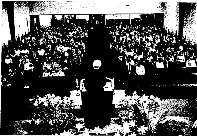
SURROUNDED BY EASTER LILIES, District Judge Dunbar Davis stood on the pulpit of the First Baptist Church of Plymouth, one of

scores of churches in Observerland where congregations hailed the Resurrection.