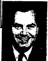
JEROME P. CAVANAGH

Jerome P. Cavanagh, former mayor of Detroit, will speak on "Problems of the Cities" at the annual meeting