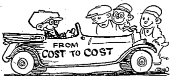
FIGURE TIRE COSTS AND YOU'LL CHOOSE SEIBERLINGS EVERY TIME. AT NO PREMIUM OF PRICE !!! SEIBERLINGS CONTAIN MORE RUBBER MORE COTTON THAN ANY TIRES BUILT IN THE WORLD.