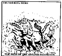
Stipe's hard-hitting vocals open the double retrospective on "Clustering Train," one of the hardest-rocking cuts on the release. Other highlights include an incredible version of the Moby Grape classic, "Omaha," "Strong, Simple and Silent" with Burnett on lead vocals, "Faithless Heart," which was co-