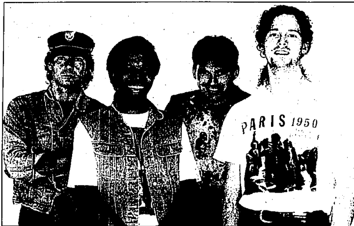
The Civilians are evolving musically as is evident by their new release, "Detonate to Explode," a seven-song effort touching on all the universal themes of those times — love, money and loneliness.