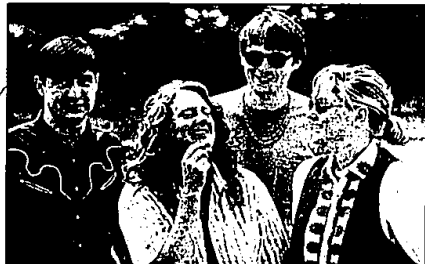
The Ellen James Society will be making a stop in Ann Arbor for a performance at the Blind Pig Wednesday, Oct. 16.

No purchase is necessary. Entry deadline is November 8, 1991. Entrants must be 18 years of age or older.