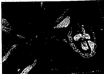
Historical photos and ribbons adorned a tree in one display window at the Focal Point Studio of Photography on Grand River. Focal Point won for Best Overall Design.