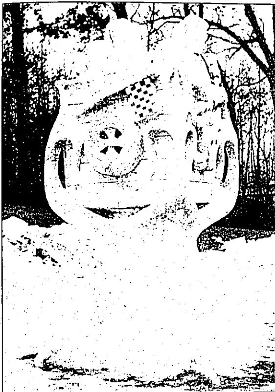
FRANKENMUTH FANTASY —More than 20 teams of artists will create 10-foot snow sculptures during Snow Fest '92. The winning team will represent Michigan in the national snow sculpting championship.

includes dancing, hors d'oeuvres and a cash bar. For reservations and information, call (517) 652-9925.