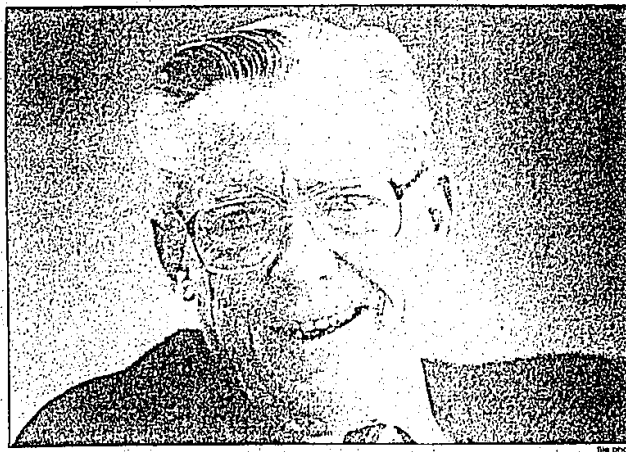
William Broomfield, R-Birmingham, the most senior GOP member of the U.S. House announced his retirement Tuesday, bringing to a close a 36-year career that ranks him among Michigan's longest-serving elected officials.

from scandal, but not controversy. His 1980s support for Nicaraguan contras drew public protests outside his district office. Others called him aloof and increasingly isolated from constituents. But Broomfield always outlasted his critics at the ballot box. Among all House members in Michigan history, only John Dingell Jr., D-Trenton, served longer. Meanwhile, area Republicans are preparing for something they haven't had in a long time — a primary in the new 11th Congressional District to determine who their party's nominee would be.