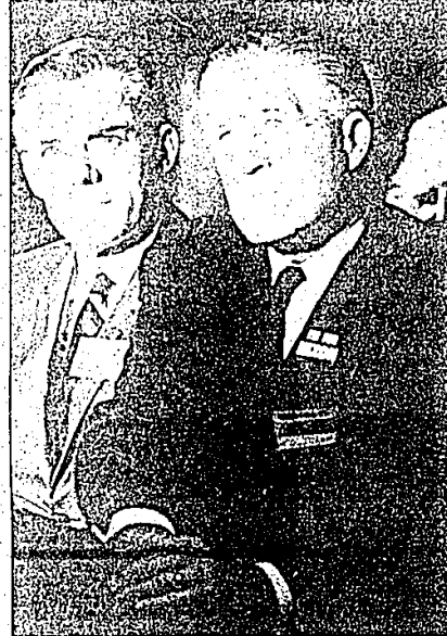
Broomfield sat alongside former Michigan Gov. George Romney at this 1968 campaign rally for GOP Presidential nominee Richard Nixon. Nixon was one of the eight presidents who held office during Broomfield's 36 years in Congress. Romney was one of six Michigan governors who held office during that same time period.