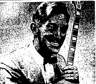
EDDIE PEABODY, by common agreement the world's greatest banjo player, will begin a one-week engagement Oct. 21 at the Thunderbird Inn, Northville Rd. at Five Mile.