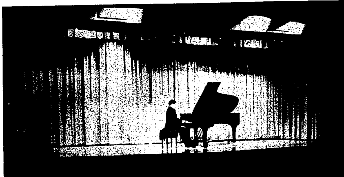
PIANIST DOPPMANN on stage in Schoolcraft's Little Theater.

SCHOOLCRAFT HAS three types of programs in this fall semester's Humanities Series: