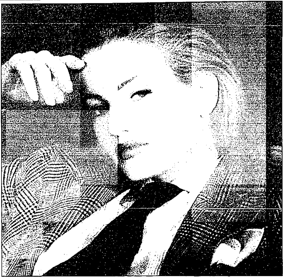
Victor/Victoria: Ralph Lauren menswear tailored suitings for women . . . an all-wool Howard double-breasted glenplaid jacket ($495) tops the Windham 100-percent-cotton French-cuffed stripe shirt ($120). A his-for-her silk tie ($65) adds a new accessory essential to her wardrobe. At The Polo Store, Birmingham.