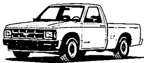
1992 S-10 PICKUP #T9124