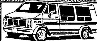
1992 FULL SIZE CONVERSION VAN #T9162

Automatic w/overdrive, 5.7 liter V-8, aux. lighting, air conditioned, power locks, power windows, tilt, cruise, chrome bumpers, 23 gal. tank, AM/FM cassette, cast aluminum wheels, power antenna, H.D. radiator & trans., cooler, cap's chair, fold down bed, custom paint, running boards, continental kit, plus interior & more.