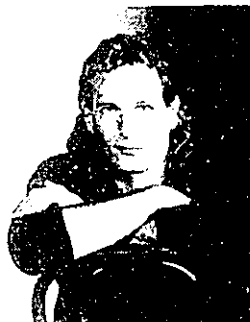
On Wednesday, NBC's This Is Michael Bolton offers the singer performing several R&B standards.