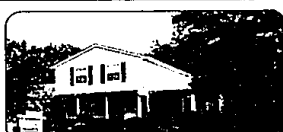
FARMINGTON HILLS. Wonderful open floor plan! Nisan-built model. Updated in neutrals. Library could be 4th bedroom. Huge 1st floor laundry. Balcony off master bedroom. Newer roof, furnace and water heater. Central air. Sprinklers. $162,500 626-9100