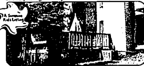
BLOOMFIELD HILLS. Three bedroom end unit Townhouse. Amenities include a brick courtyard, hardwood floors, tasteful decor and crown moldings. Sharp white kitchen, 2 1/2 baths, fireplace, close to pool and clubhouse. $187,900 646-6000 01-B-7085