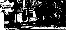
WEST BLOOMFIELD. Dramatic new Contemporary on a large wooded lot. Three bedrooms. Master suite with loft and bath. Fireplace in the great room. Library, 1st floor laundry, basement. West Bloomfield schools. Two car garage. $145,900 851-8100 06-B-7140