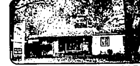
SOUTHFIELD. Over an 1/2 acre of serenity! This 3 bedroom aluminum Ranch is located on a quiet street and close to shopping and expressways. Living room with fireplace, family room and 1st floor laundry. Fenced yard. $75,900 626-9100 02-B-7624