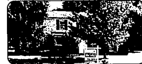
FARMINGTON HILLS. This well maintained 4 bedroom home features neutral decor. Boasts newer ceramic flooring in kitchen and foyer. Some newer carpeting, oversized master suite with bath and family room with fireplace. Court location! $159,900 626-9100