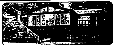
WEST BLOOMFIELD. Lovely 4 bedroom, 3 bath home in a beautiful setting on spring-fed Union Lake. Features an expansive great room with Southern exposure and panoramic views. Gourmet kitchen with JennAir, Sub Zero and built-ins. Walk-out lower level with posh family room. 72' of lake frontage. $515,000 851-8100 06-B-6683