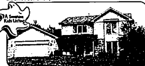
CLARKSTON. Lake privileged! Four bedroom family room with island kitchen, spacious bedrooms, French doors to living room and doorways from kitchen and family room to extensive decking. Neutral decor, central air, fireplace. $177,900 646-6000 01-B-7435