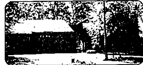
WEST BLOOMFIELD. Custom-designed around an atrium! Unique 3 bedroom Contemporary with an open, flowing floor plan. Very private yard with gazebo and decks. Heated 3 car garage with loft. Middle Stralis privileges. Truly a must see. $234,900 651-8100