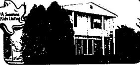
OPEN SUNDAY 1-4. 2496 Coral Drive, E. of John R. S. of Square Lake, TROY. Stately Colonial on a beautiful corner lot. Immaculate condition with 4 bedrooms, formal living and dining rooms, 2 1/2 baths. Large family room with fireplace. $152,900 689-8900