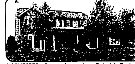
ROCHESTER. Open, airy custom Colonial. Features French doors to library/den, 2nd floor laundry, large dining area, oak cabinetry and central air. Fifth bedroom and 3rd full bath in basement. Swimming and tennis in sub. $199,900 651-8850 04-A-7265