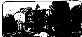
WEST BLOOMFIELD. Magnificent home. Great room with 10 foot ceiling, ceramic fireplace and sunny windows. Bay windows in den and dining room. Dream kitchen. Master bedroom has 2 walk-in closets, dressing room and Jacuzzi. $399,900 626-9100