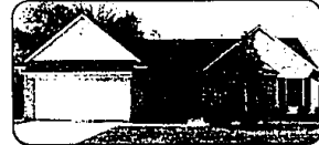
TROY. Affordable new construction in a great new sub! Three bedroom, 2 bath Ranch. Features a master bath, walk-in closet, cathedral ceilings in great room and foyer, formal dining room and eating space in kitchen. Immediate occupancy. $156,900 689-8900