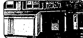
TROY. Sharp 2 bedroom Townhouse. Quality appointments include a living room fireplace, master bedroom sitting area overlooking 2-story foyer and wood windows with treatments. Newer furnace. Central air. Basement. Great complex. $94,900 689-8900