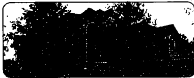
ROCHESTER HILLS. Dramatic new construction in one of Rochester's finest areas. Quality construction throughout. First floor master bedroom with fireplace and fantastic bath. Large cedar deck overlooking lot. Pillared great room with 18' ceiling. JennAir appliances including refrigerator. Three car garage. Security and central air. $479,000 651-8850