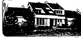
ORCHARD LAKE. Luxury end unit Condo on Mirror Lake. Beautiful views overlooking lake and woods. Three bedrooms, 2 1/2 baths, 1st floor master suite with dressing area and walk-in closet. Professionally decorated. Two car garage. $295,000 851-8100