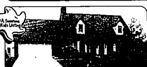
ROCHESTER HILLS. Classic Cape Cod with impeccable decor! Family room with fireplace. Office in lower level can be 4th bedroom. Exceptional master bedroom. First floor laundry, central air, 2 1/2 baths. Deck overlooks common area. $169,900 651-8850