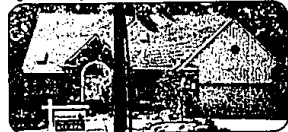
EXCLUSIVE MISSION SPRINGS. This neutral, custom home offers the finest appointments. Fieldstone entry, Palladian windows, extensive use of oak. Great room with cathedral ceiling, den and master suite with Jacuzzi. You'll love it. $314,900 651-8100