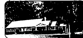
FARMINGTON HILLS. Beautiful 3 bedroom house on approximately 1.2 acres with additional acreage available. New kitchen with skylight and pantry. Family room, dining room, library, 2 baths and a deck. Fireplace in the living room. $133,000 646-6000