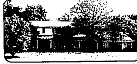
FRANKLIN. Beautiful Colonial on a gorgeous lot. Flowing floor plan. New off-white carpeting. New kitchen and pantry flooring. Massive master suite with dressing area. Private treed yard with pool and cabana. Walk-out lower level. $349,000 651-8100