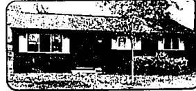
ROCHESTER HILLS. Country living at its finest! One of the largest homes in the area. New furnace, central air, Berber carpet and steel doors. Family room has fireplace with heatolator. Two full baths. First floor laundry. $86,900 689-8900 05-A-7627