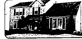
WEST BLOOMFIELD. Fall in love with this meticulous 4 bedroom home. Neutral decor. Bay window in dining room. Central air, 1st floor laundry, expansive family room with fireplace and oversized master suite with private bath. $159,900 626-9100 02-B-7553