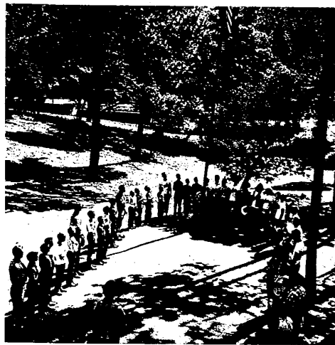
RANCHERS REPORT to the colors and after pledging allegiance are inspected by a registered nurse who checks for cleanliness and general well-being. Then the boys are given bunks for their five-week stay at Hidden Valley Camp.

"For a moment, or moments, beasts and children were friends, there in the sweetness and silence of the night, there in the calm and lovely fields of the Lord."