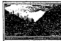
Albert Bierstadt, oil on paper on board, 13" x 19", Sun. #2011