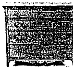
1790-1810 American Hopplewhite Cherry Chest H. 3'9", W. 42", Sunday #2103

Tyrus H. Cobb Hand-Written Letters on Saturday