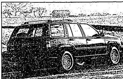
The 1993 Jeep Grand Wagoneer