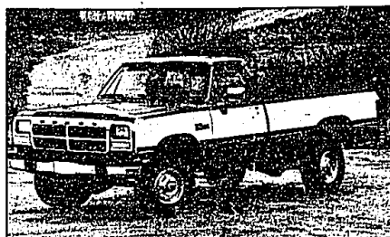
The 1993 Dodge W 250 (diesel)