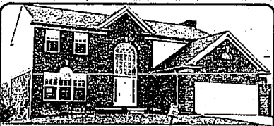
NEW, LIGHT AND BRIGHT COLONIAL home featuring master bath, 2-story foyer with hardwood floors, 2nd floor laundry, and custom dock. $199,000. 647-7100. 202 Grosvenor, S. of Avon, E. of Rochester. GRR-B07791