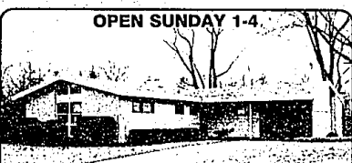
OPEN SUNDAY 1-4