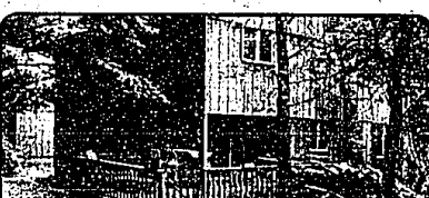
WEST BLOOMFIELD CONTEMPORARY. Easy living detached condominium with access to the lake! Finished basement, 3 bedrooms, 3 1/2 baths, sun & fun deck. Surrounded in tree beauty. $139,000. 851-6900 RER-M31196