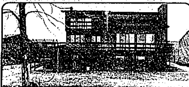
LAKEFRONT CONTEMPORARY multi-level home. Views out every window, 4 bedrooms, 3.5 baths, decks, and walk out lower level with second kitchen for entertaining. What else could you want? $300,000. 647-7100 ANA-B07068