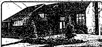
VERY MOTIVATED SELLER!! Stunning 4 bedroom contemporary with quality throughout. In prestigious Deer Run Circle. 3 full/2 half baths, and magnificent white kitchen with sub-zero and Jennair. $515,000. 851-6900 DEF-M23866