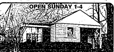
OPEN SUNDAY 1-4