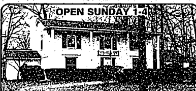
OPEN SUNDAY 1-4