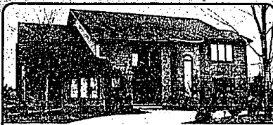
AWARD-WINNING STONY POINTE Contemporary, 4400 sq. ft. gourmet oak kitchen, breakfast patio and deluxe appliances, and triple oak staircase to 2700 sq. ft. finished lower level. Quality thru-out. $489,000. 647-7106 STY-B07712