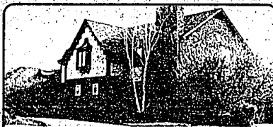
BLOOMFIELD HILLS CUSTOM TUDOR. Designed for entertaining and ease of lifestyle. Exceptional landscaping, master bedroom features deep bay, and bar/quiet size dining room. 4 bedrooms, and more. $449,000. 851-6900 AST-M-16878