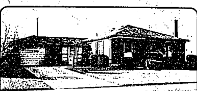
DESIRABLE AREA OF ROYAL OAK. We offer an updated 3 bedroom home including 1.5 baths, heated Florida room, dining area, two fireplaces, fenced yard, and attached garage. $117,900. 647-7100 BEN-B07130

647-7100 1821 W. Maple Birmingham- Bloomfield