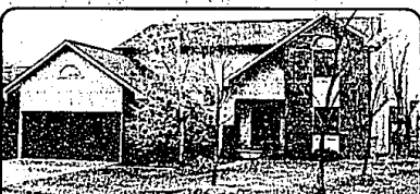
BETTER THAN NEW CONDO. Fabulous decorator interior, beautiful deck and finished lower level. Fireplace in living room, den, and gracious master suite. $183,000. 851-6900 PIT-M30189