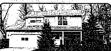
"WELL MAINTAINED" 3 bedroom, 1 1/2 bath colonial in park like setting, and lake privileges on Twin Sun Lake. Hardwood floors in foyer, kitchen & breakfast area. Never furnace and air. $148,900. 851-6900 GRY-M34356