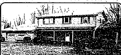
DISCOVER THE GOOD LIFE. Pine Lake Estates large colonial with Pine Lake beach privileges. Den, finished basement, hardwood floors, 4 bedrooms, 3 baths, and 1st floor laundry. $184,900. 851-6900 WER-M28480