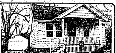
BIRMINGHAM IN-TOWN. Wonderful bungalow with extensive updating. Upstairs could be 3rd bedroom or study, newer kitchen and bath, plus hardwood floors. A real charmer. Buyer protection warranty. $79,900. 851-6900 CHN-M28594