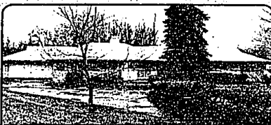
LOVELY SETTING. With this custom ranch with walk-out lower level leading to lovely private setting. 3 bedrooms, 3 baths, and ready to move into. $242,000. 851-6900 MAE-M27634