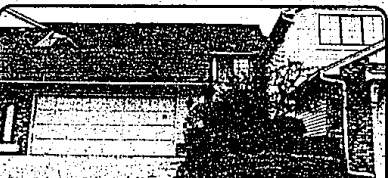
MUST SELL this elegant ranch condo in prestigious gatehouse community. Spacious, 2 bedroom ranch with library, vaulted ceilings in Great room and master bedroom. Custom features throughout. $180,000. 851-6900 PEE-M30352