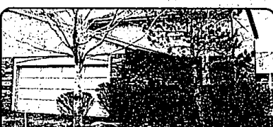
WEST BLOOMFIELD. Immaculate end unit townhouse. Neutral decor, central air, and huge master suite could be divided to make third bedroom. Good opportunity for qualified VA buyer. $159,900. 647-7100 FOE-B07828