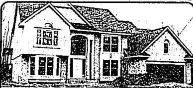
WEST BLOOMFIELD. Spacious, graceful colonial a first-owner's dream. Spacious floor plan, island kitchen, sun room, step up master suite with luxurious bath. Extras include cathedral ceilings. $289,500. 851-6900 MIN-M33334