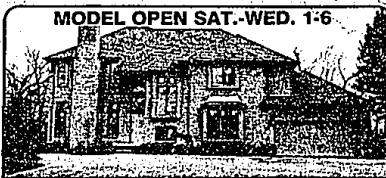
MODEL OPEN SAT.-WED. 1-6