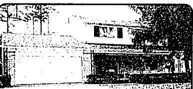
BIRMINGHAM COLONIAL. Priced to sell - 3 bedrooms, 2 1/2 baths, family room, fireplace, basement and 1 1/2 car garage. Walking distance to downtown, and all conveniences. Immediate occupancy. $189,000. 647-7100 MAE-B06286