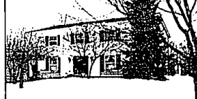
BEAUTIFUL Georgian Colonial on 1.37 acres in Oakland Twp. Many mature trees. Large bedrooms, ceramic foyer & kitchen, 2 full & 3 half baths, finished walkout lower level and beautiful inground pool. $234,000 (81CA) 652-8000