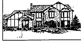
LOVELY Tudor Colonial in popular Rochester Hills area. Clinton River runs thru sub for added charm, 6th bedroom w/full bath and whirlpool tub in lower level. Finished rec room and Home Warranty. $240,000 (70WH) 652-8000