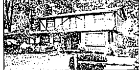
WEST TROY. Tower trees shade the rear yard of this 4 bedroom, 2 1/2 bath Colonial, family room with fireplace, professionally finished basement, modern gourmet kitchen, near Somerset Mall. $177,000 (56MED) 524-1600