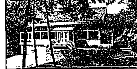
SPECTACULAR view on 2.5 acres in Oakland Twp. Unique contemporary custom home, three levels, approximately 6,400 sq. ft. accessible by elevator. Dream kitchen with 7x13 glass wall overlooking gardens. $595,000 (71LV) 652-8000