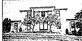
MOVE IN CONDITION. Brick and cedar colonial with side-turned garage, 4 bedrooms, 2 1/2 baths, family room, private lot on cul-de-sac. (15APP) 642-8100