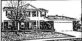
BEACH & LAKE PRIVILEGES. 4 bedroom, 3 1/2 bath Colonial. Over $30,000 in updating in past 2 years. Finished full basement, professionally landscaped, large treed lot in Emerald Lake. Backs to water. $219,900 (69NOR) 524-1600