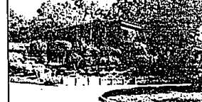
BEAUTIFUL contemporary with 4 bedrooms. Indoor swimming pool makes you think your in the tropics, custom built in serene setting, oak beams, has every amenity one could ask for. (05CHE) 642-8100