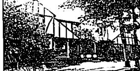
SPECTACULAR 5 bedroom, 4 1/2 bath Tudor with over 4000 sq. ft. of living space on large wooded cul-de-sac lot with gorgeous pool, large bedrooms, 3 car garage. (81HD) 642-8100