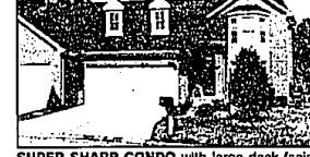
SUPER SHARP CONDO with large deck facing woods! Great room with natural fireplace, master suite on 1st floor, full basement, 2 car attached garage, located on cul-de-sac in Rochester Hills. $199,500 (10VAL) 652-8000

4820 Rochester Rd. Troy, MI 48098 524-1600 Hrs.: Weekdays 9-9 Weekends 9-5