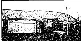
CONTEMPORARY ranch in Chambard. A very special residence for a special buyer. Magnificent appointments and built-ins throughout. Designed for an adult lifestyle which desires the very best. (37MON) 642-8100