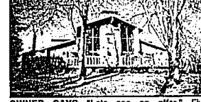
OWNER SAYS "Lats see an offer." Five bedroom, 4 1/2 bath, finished walk-out basement, 1st floor master suite. Private setting, electronic gates, full 10 car attached garage. Oakland Twp. $749,000 (88DUT) 652-8000