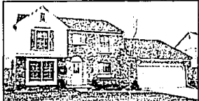
PRIDE OF OWNERSHIP in this 4 bedroom, 2 1/2 bath Colonial located in Troy. Master bedroom with walk-in closet. Family room with fireplace, central air, sprinkler system and paving brick patio. $189,500 (01GR) 524-1600