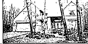
FABULOUS Brantwood model in decorator perfect condition. Huge foyer with hardwood floors, library with French doors, 2 story living room with fireplace, almond formica kitchen with island. (30MS) 642-8100