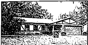
TROY. Completely updated Brick Ranch. 3 bedrooms, 1 1/2 baths, oak kitchen with island, oak baths, 1st floor laundry, new carpet, basement and central air. Perfect for Retiree or Young Family. $154,900 (61CR) 524-1600

CENTURY 21 INTERNATIONAL AWARD WINNING OFFICES