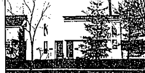
SLEEK contemporary condo for the sophisticated buyer, close to every city convenience, master bedroom fireplace and living room fireplace, 2 1/2 baths, 2 decks, hardwoods. (72BRD) 642-8100