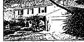
WHAT A beautiful home for entertaining or raising children on all-sports lake, just 5 miles from I-75 in Clarkston. Four or five bedrooms, 4 full baths, 2 fireplaces, walk-out lower level with kitchen & fireplace. $279,900 (82SAS) 652-8000