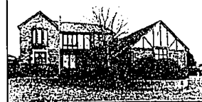
TUDOR with a pool! Great home for a family, close to schools, 3 car garage, finished basement, loaded with extras including central air, sprinklers, open floor plan. Located in Rochester Hills. $249,500 (15SUM) 652-8000