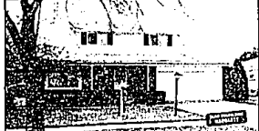
MANY UPDATES in this 4 bedroom Colonial. Kitchen cabinets. Floor, dishwasher '88, family room carpet '92. Two upstairs bedrooms carpet '92, living & dining room painted '91, central air, patio, fenced yard. $109,900 (70ATH) 524-1600