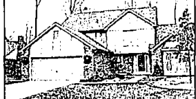
TROY. 4 bedroom, 2 1/2 bath Colonial. 2 years old. Neutral decor, 1st floor laundry, hardwood floors in foyer and in hall, walk-in closets in all bedrooms, fully excavated basement and added height in ceiling. $199,900 (80CRD) 524-1600