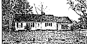
TROY SCHOOLS. Country size lot, master bedroom suite with new bathroom, adjoining room 12x11'3" for nursery. Library, 1st floor laundry, lower level family room with fireplace and possible 4th bedroom. $124,900 (96ALP) 524-1600