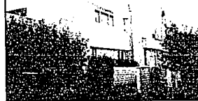
STUNNING contemporary directly on Wabcock Lake. 3 bedrooms, over 4000 sq. ft. of space, loads of marble flooring. Magnificent water views, first floor master bedroom suite. (57ALE) 642-8100