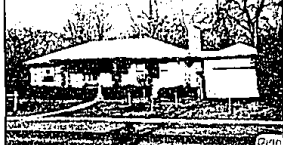
IMMACULATE open floor plan ranch with neutral decor, large family room and dining room combination, 3 bedrooms, basement, attached garage. (49MAP) 642-8100